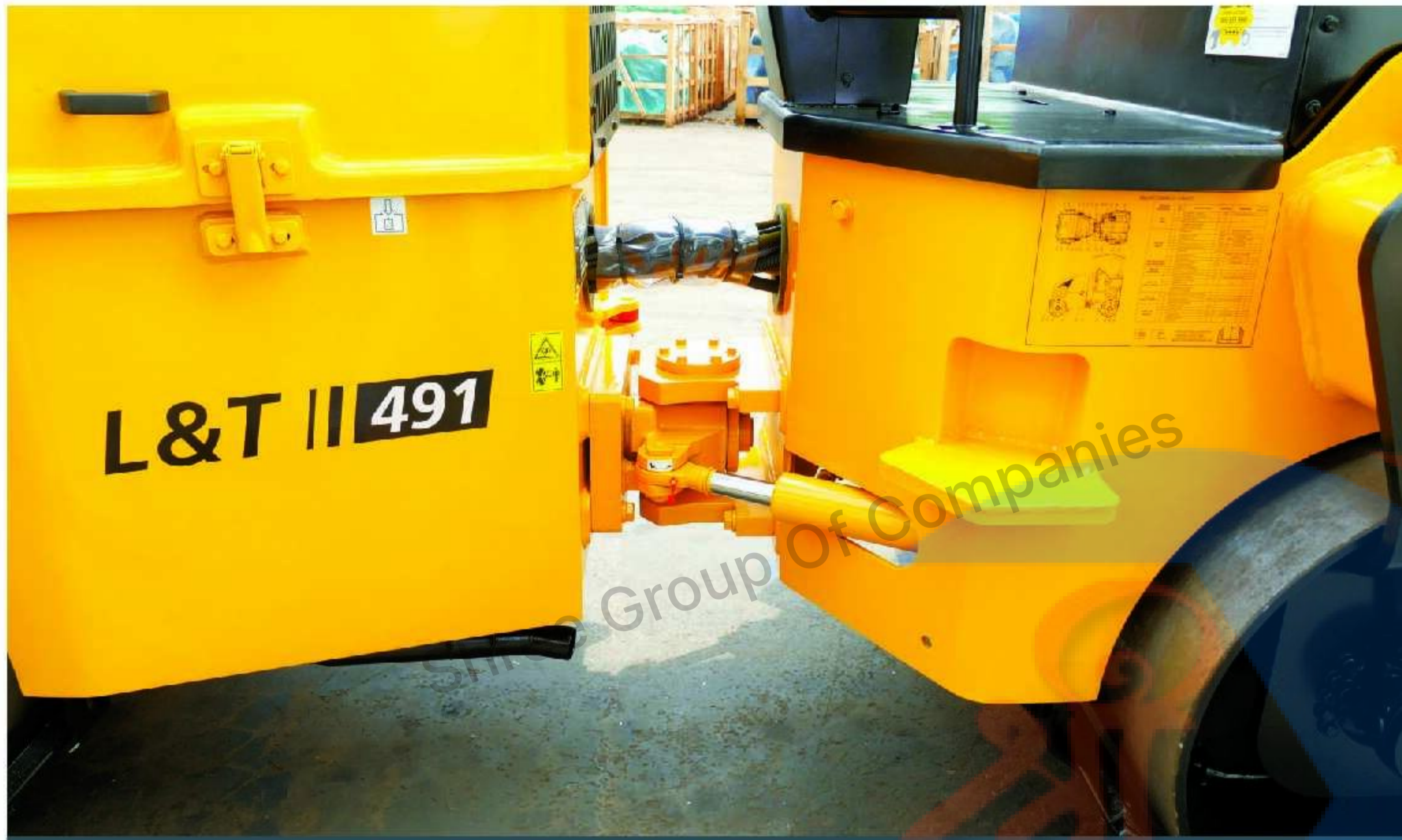
Sturdy Articulation Joint