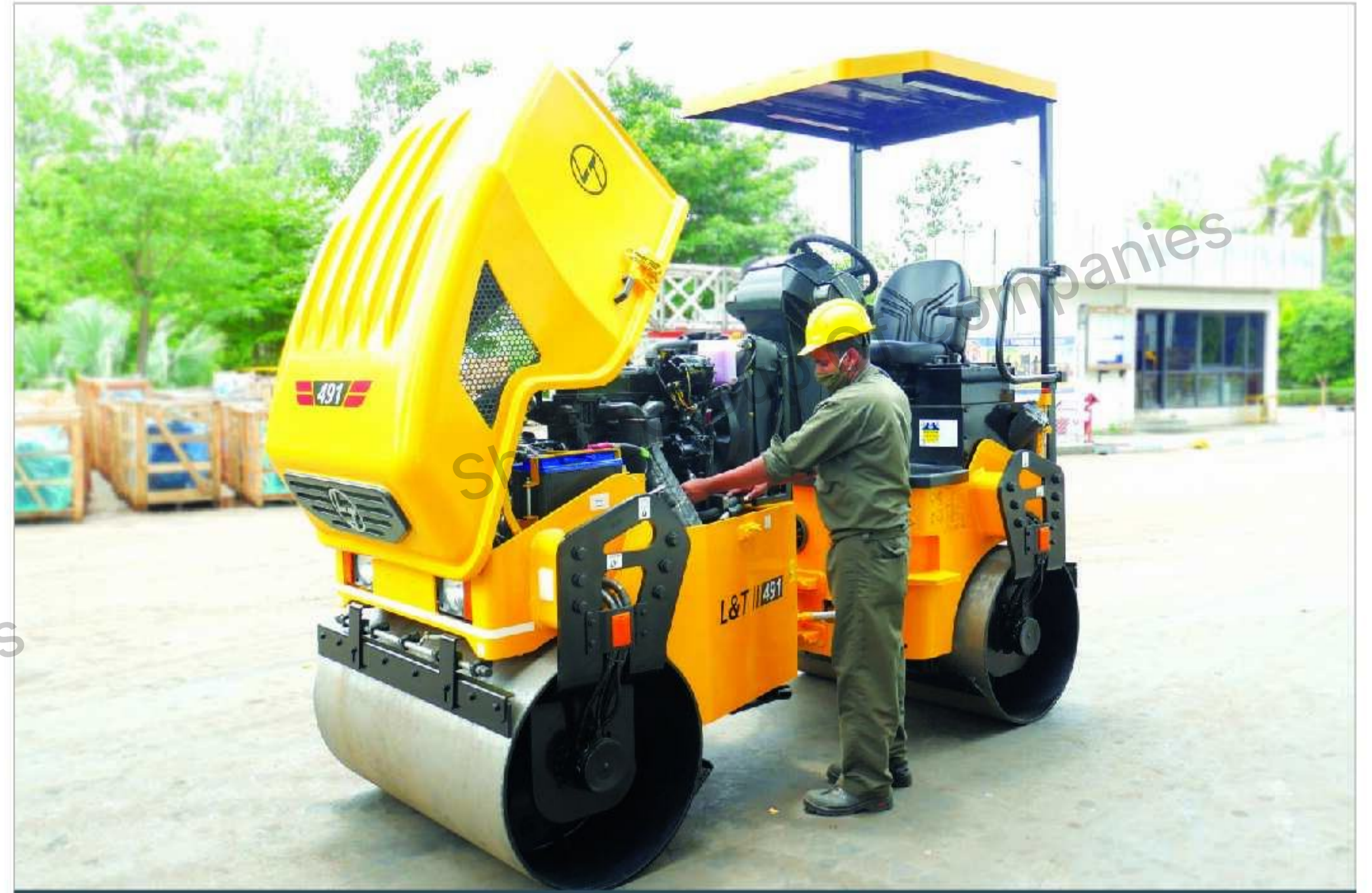
Ground Level Service Access