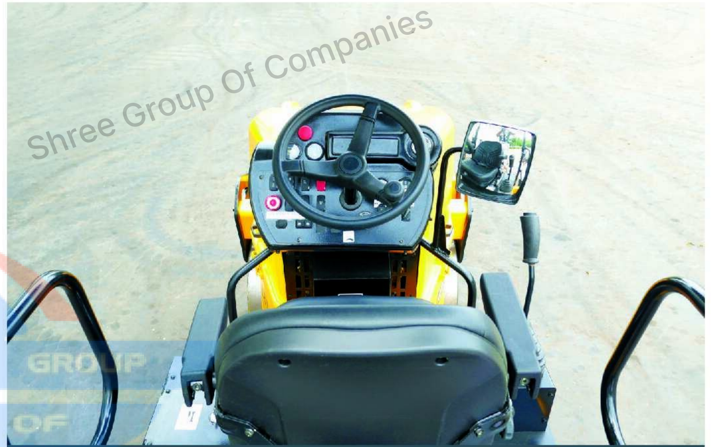
Excellent all-Round Visibility