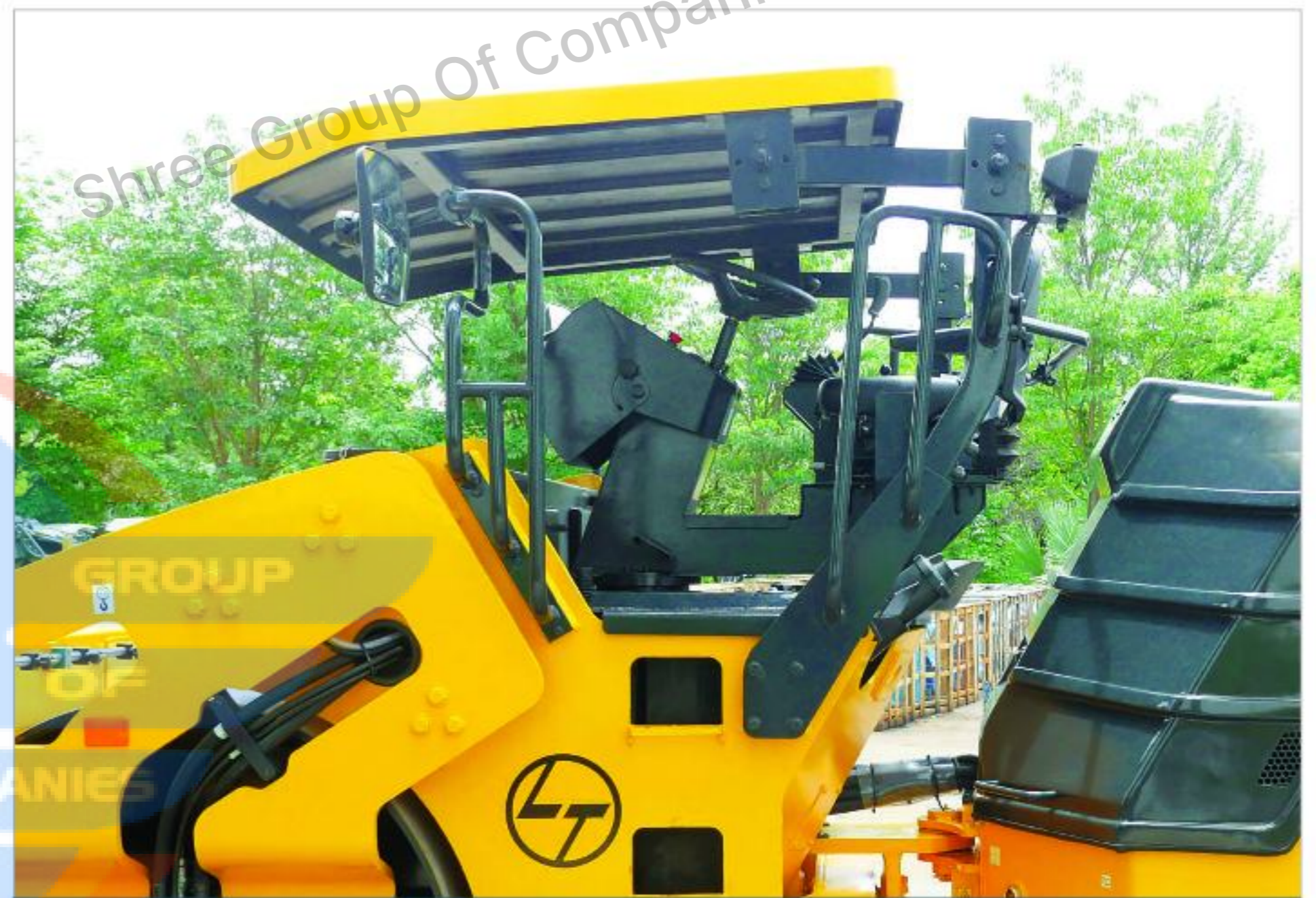
Foldable canopy for ease of transportation