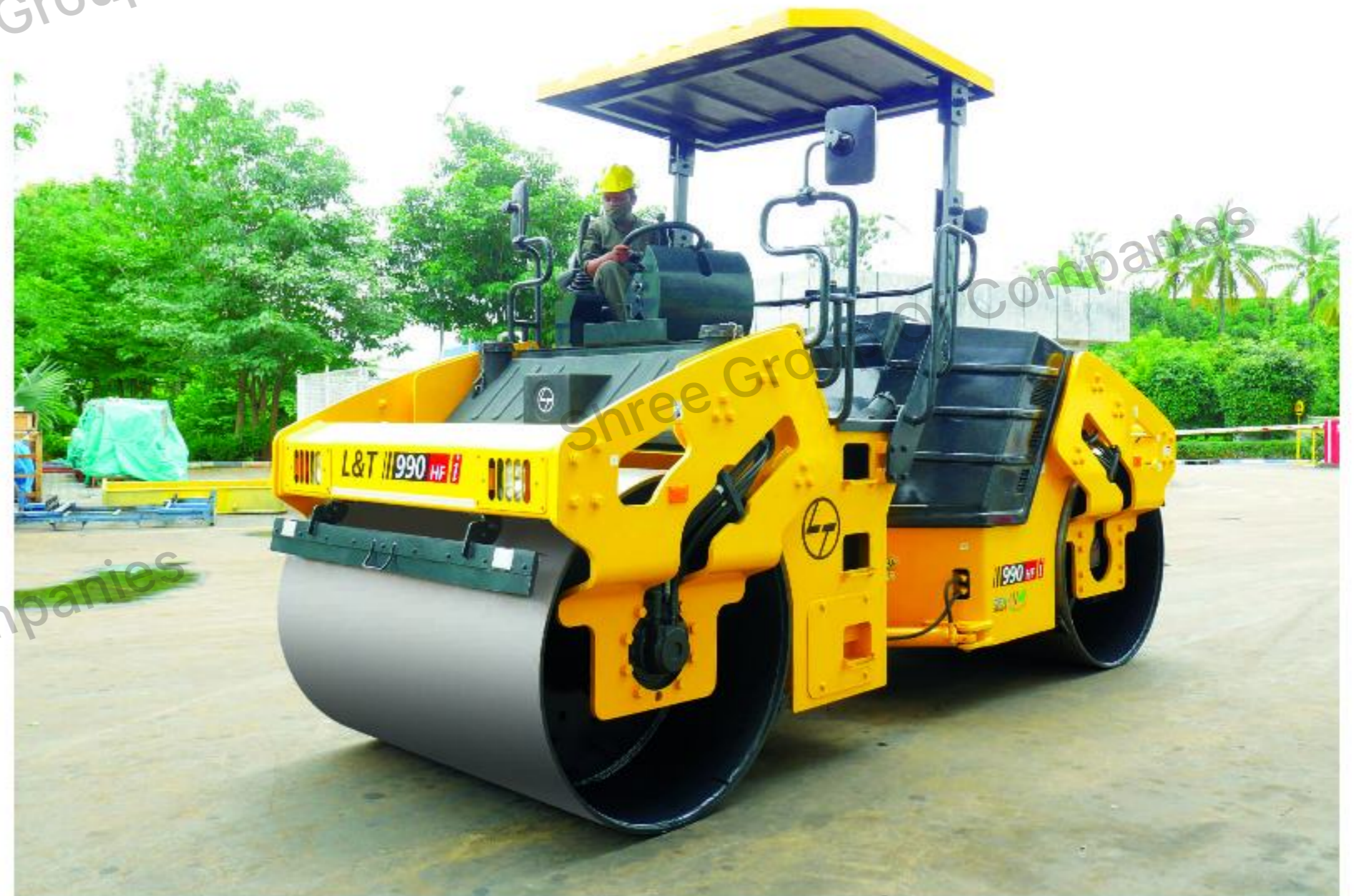
Better all round operator visibility