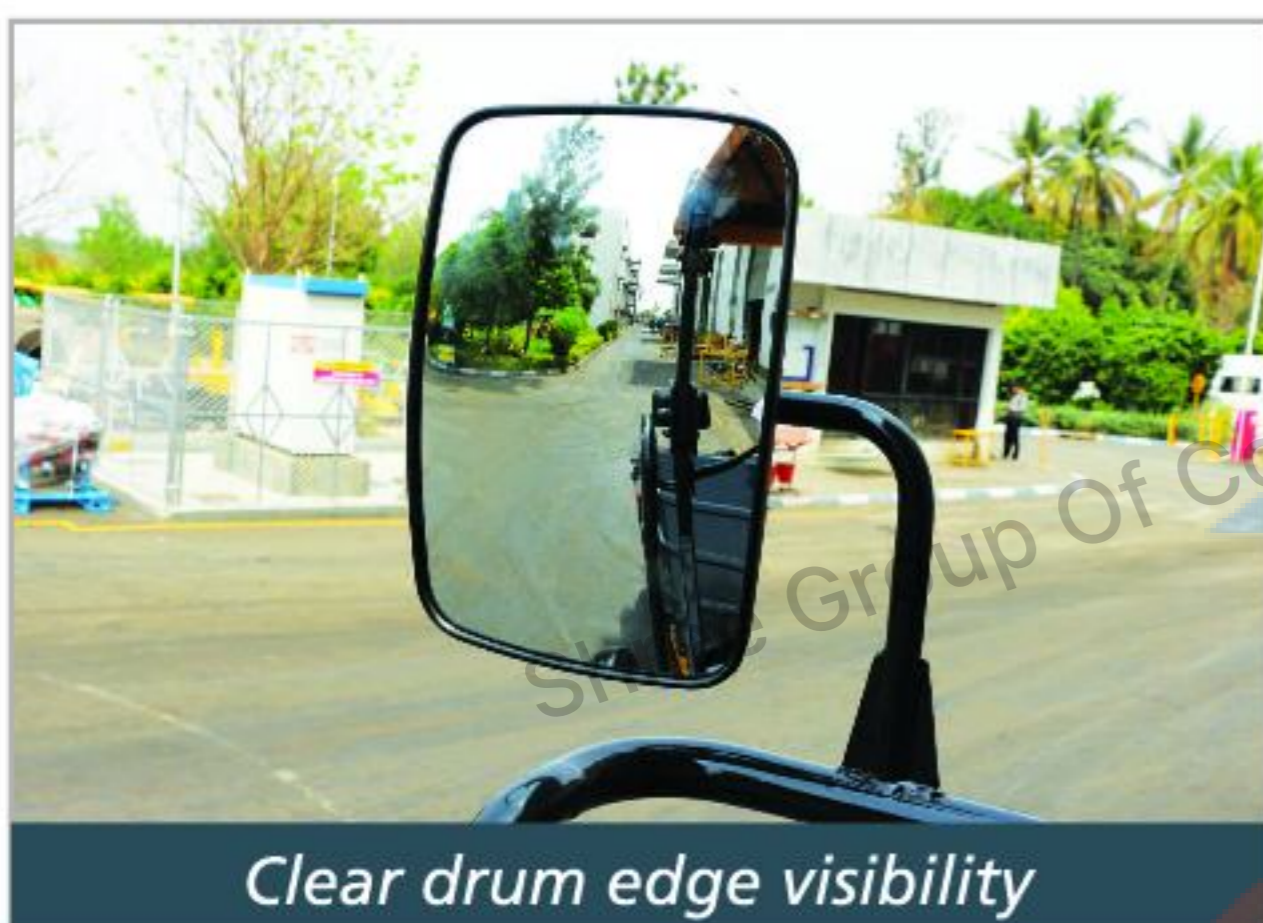
Clear drum edge visibility